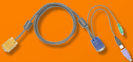
CE-6 Combo KVM