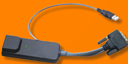
DG-100SD Cat6 Dongle