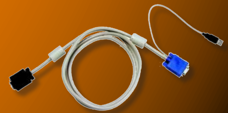
CB-6 USB Hub KVM Only