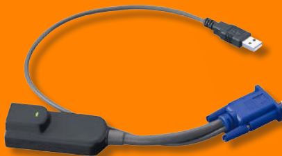
DG-100S Cat 6 Dongle